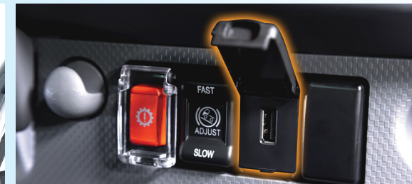
Brand New Feature - USB Charging Port