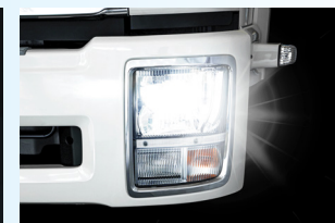
LED Headlight to provide better visibility